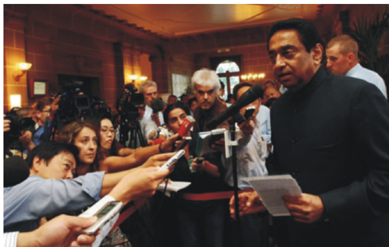
Commerce & Industry Minister Mr. Kamal Nath addressing the media after the breakdown of the talks in Geneva .

On his return from Geneva, Mr. Kamal Nath, Minister of Commerce and Industry, who led the Indian delegation to the talks, gave India's perspective on the outcome on July 31, 2008 in New Delhi: