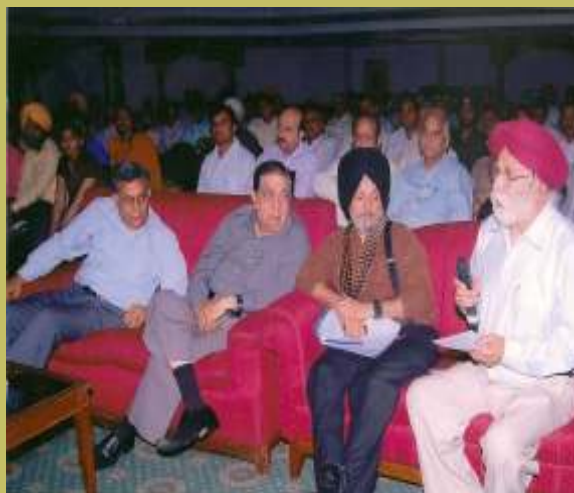
Participants at the Seminar in Ludhiana